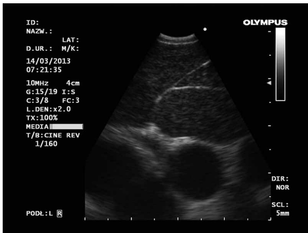
FIGURE 2 Endoscopic ultrasound imaging of subcarinal nodes in sarcoidosis

clinical stage I or II; enlarged mediastinal lymph nodes on computed tomography (short axis \geq 10 mm); and the general condition allowing to perform MS, VATS, and TBLB.