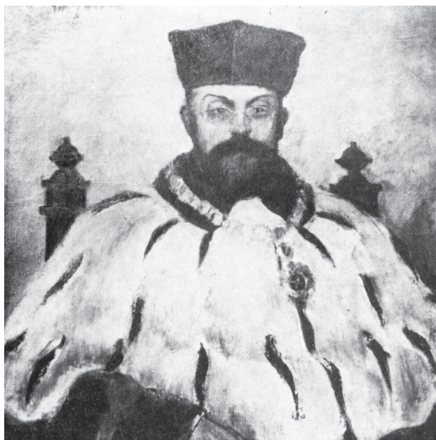
Fig. 4. Napoleon Cybulski (1854–1919).

In 1912, James Bryan Herrick (1861–1954) from Chicago found that using the ECG machine, myocardial infarction might certainly be diagnosed intravitaly and the autopsy was