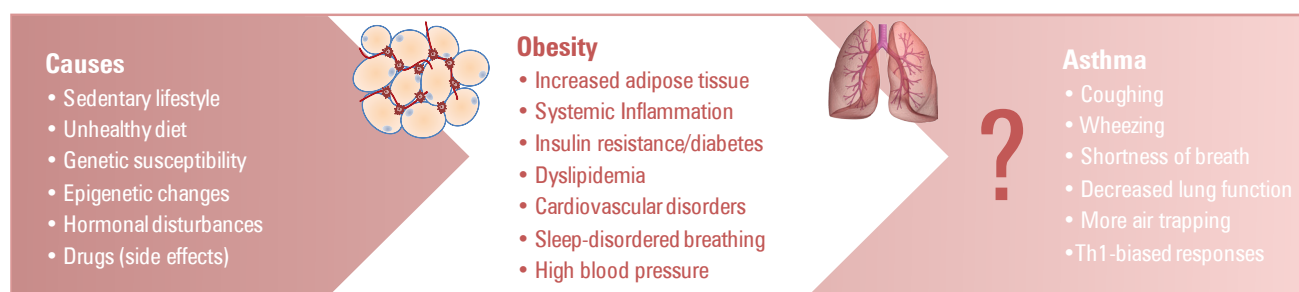
FIGURE 2 Schematic overview of the effects of obesity on the development of asthma