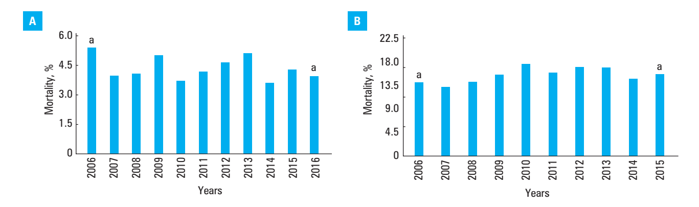
FIGURE 3 Mortality of patients with aortic stenosis; A – 30-day mortality (a P = 0.28); B – 1-year mortality (a P = 0.07)

2016 was 4.35% (659 patients), and it did not decrease over the follow-up (5.4% in 2006 vs 4.0% in 2016, P = 0.28) (FIGURE 3). In patients older than 70 years, the 1-year mortality rate dropped from 20.73% in 2006 to 15.20% in 2016. However, during the 10-year follow-up, mortality was higher in patients older than 70 years compared with younger patients (8601 [20.5%] vs 6557 [8.7%], P < 0.001). Furthermore, the 1-year mortality rate was lower in women than in men (2384 patients [7.93%] vs 4173 patients [9.24%], P < 0.001).