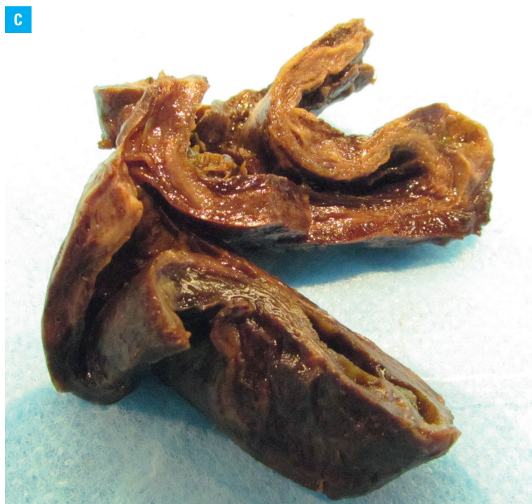
FIGURE 1 A – a computed tomography scan of the patient’s enlarged gallbladder (8.96 cm x 4.7 cm); B – an ultrasound image of the enlarged gallbladder with blood clots inside (9.9 cm x 5.7 cm); C – histopathological findings showing active cholecystitis with intramural hematoma

Our patient with severe AHA who presented with hemobilia as a complication posed a serious clinical challenge. We suggest that when an invasive procedure is needed, a patient with AH should be transferred to a clinical center with an experienced, multidisciplinary medical team that may facilitate hemostatic control and perform the surgical procedure. The availability of bypassing agents is also indispensable because they have been recommended as the first-line therapy for all patients with AH and any active bleeding.