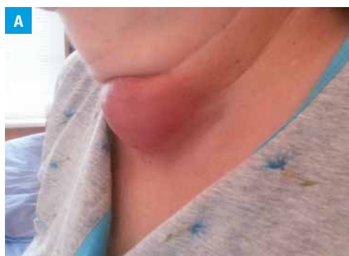
FIGURE 1 Lesion on the neck found on admission to the hospital; A – local erythema and warming of the skin; B – a computed tomography scan showing an extensive pathological mass (68 × 65 × 88 mm) characterized by low density and numerous enlarged lymph nodes

During hospitalization, the patient received adequate therapy for acute kidney injury, which was most probably iatrogenic and induced by clindamycin therapy. Intravenous antibiotic